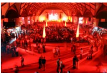
Praha - Holešovice Fairground