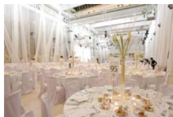
Trade Fair Palace