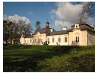
Bon Repos Château