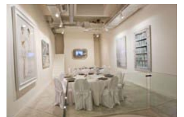
dvorak sec contemporary