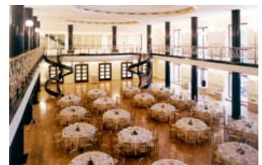
Slovanský d m