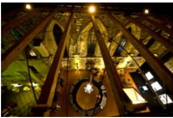
Prague Crossroads (St. Anna Church)