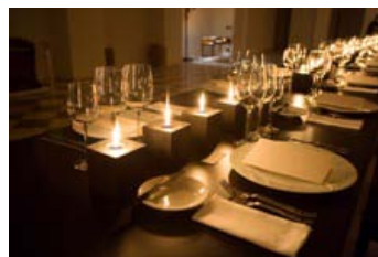
Czech Museum of Music